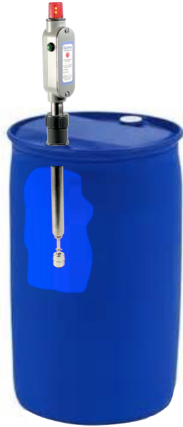
DRUM WITH T-IS ALARM